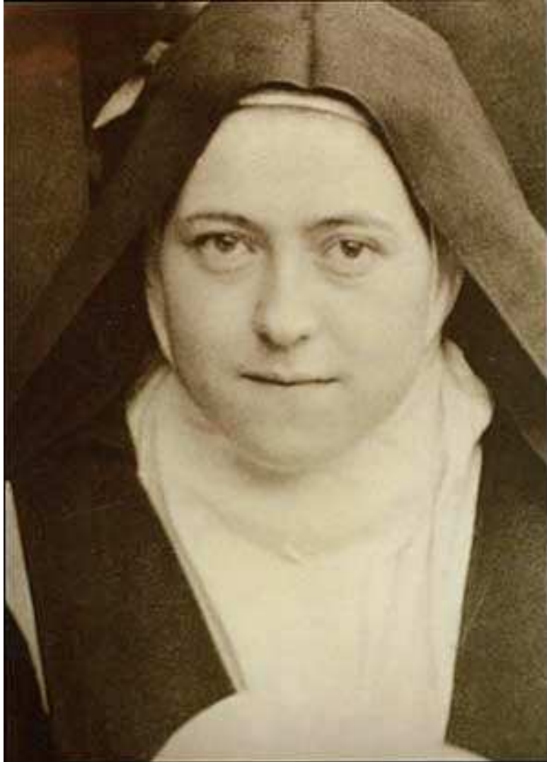
Saint Theresa of the Child Jesus